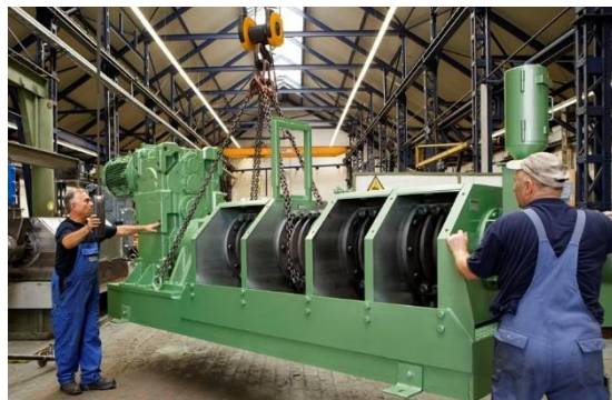
AP 15 | Processing capacity from 750 to 1000 kg/h depending on the seed