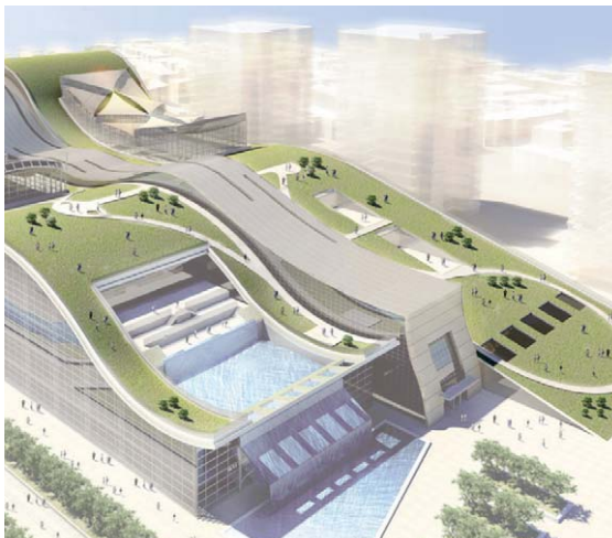
"natureline" green roof system made from ARBOBLEND®.

ARBOFORM®, ARBOBLEND® and ARBOFILL® can be processed by injection moulding, extrusion, calendaring, blow molding, thermoforming or pressing into moulded parts, semi-finished product, sheets, films or profiles.