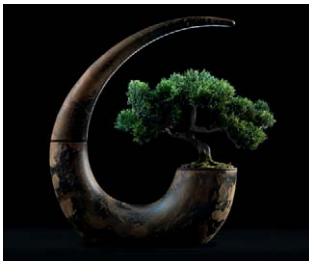
Romolo Stanco's Green Lamp made from ARBOFORM®.