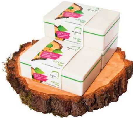
Storage box systems made from ARBOBLEND®.