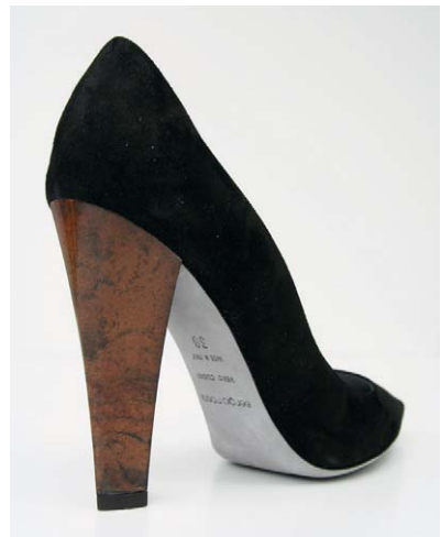
Sergio Rossi/Gucci Group: Eco Pump made from ARBOFORM®.