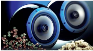
Loudspeaker made from ARBOFORM®.

There is the option to mark and advertise your products with the established TECNARO inside-label. Please feel free to contact us!