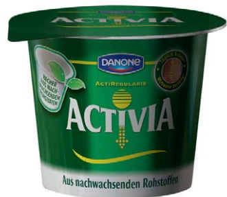
Danone yogurt cups made from Ingeo plastic