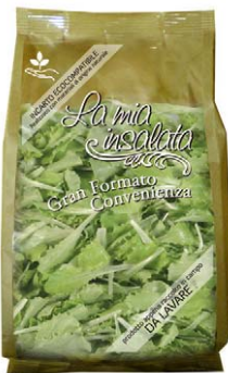
Nativia La Mia Ensalata utilizing Ingeo film

Innovative products made with Ingeo, an ingenious and naturally advanced material made from renewable and abundant natural resources.