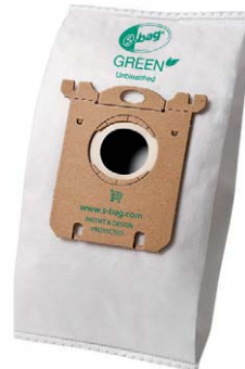
Electrolux s-bag® GREEN dust bags made from Ingeo fibers