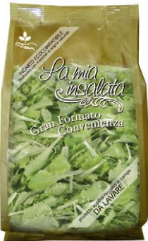
Nativia La Mia Ensalata utilizing Ingeo film

Innovative products made with Ingeo, an ingenious and naturally advanced material made from renewable and abundant natural resources.