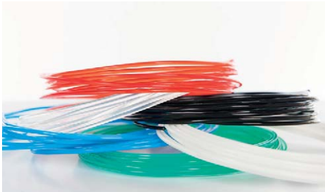
3Dom Ingeo-based filament used in 3D printing