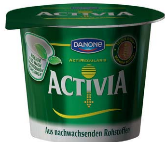
Danone yogurt cups made from Ingeo plastic