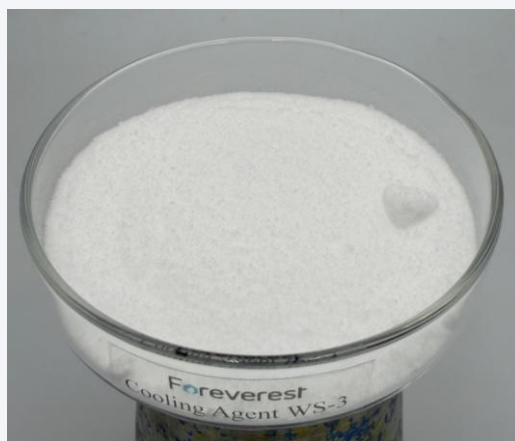
WS cooling agent sample