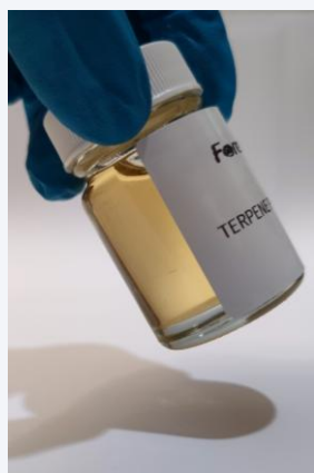
Terpene polymer sample