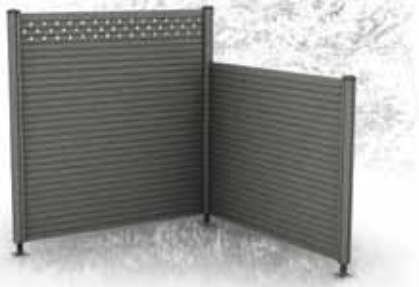
Fig. 2: WPC Garden fencing