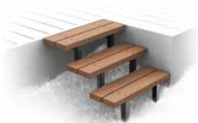
Fig. 4: Construction planks made from WPC

used to produce for example horse riding obstacles, stairs (Fig. 4) shoe soles and walking sticks, consumer goods and household electronics, using different production methods, mainly injection moulding. Also new production methods are being developed, for example the extrusion of wide boards with or without foaming.