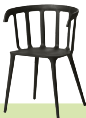
Fig. 5: PS 2012 injection-moulded WPC chair