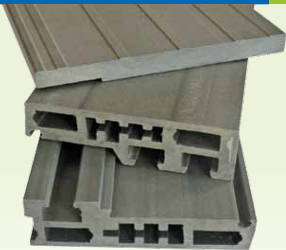
Fig. 3: Extruded WPC-profiles