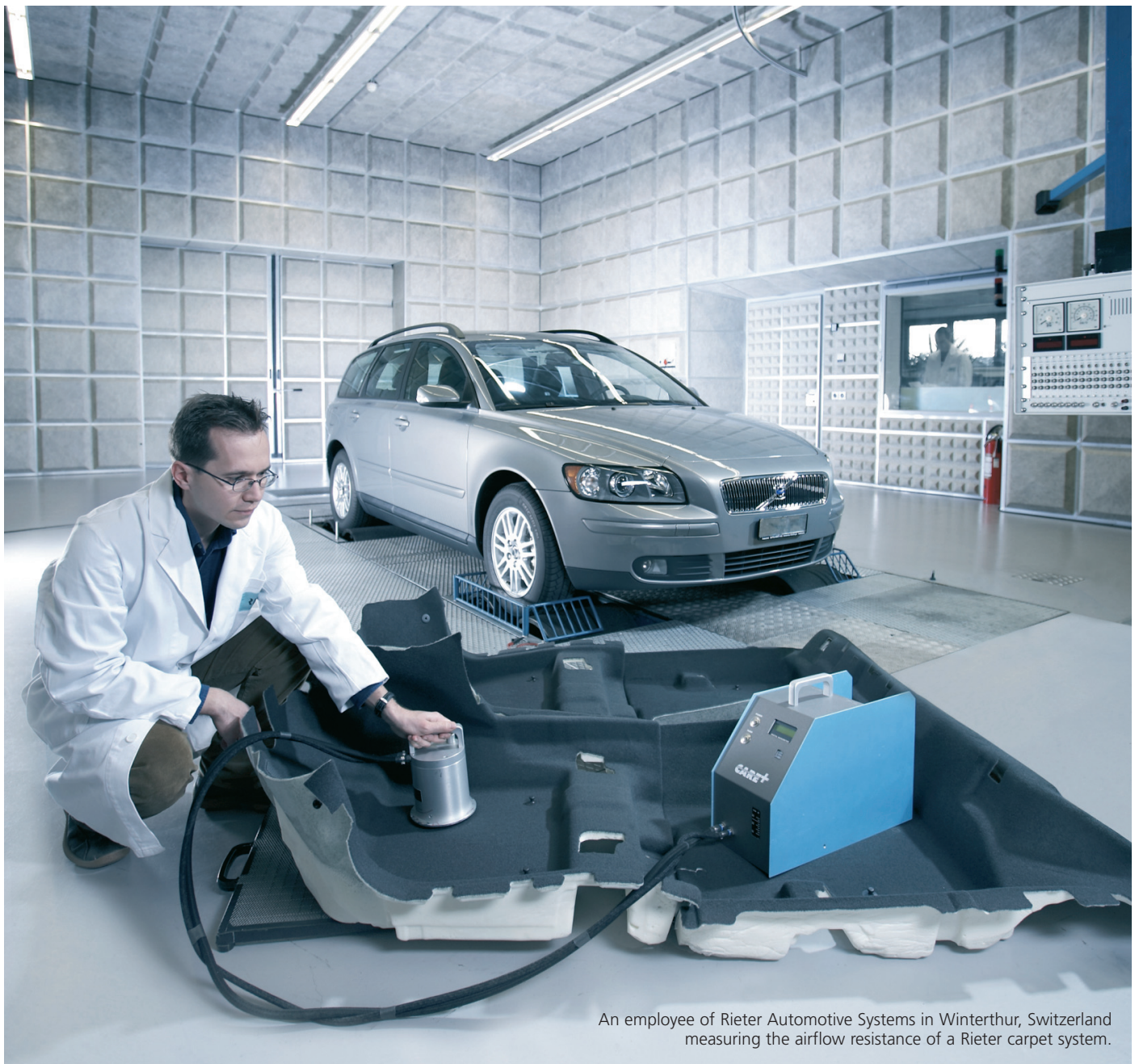
An employee of Rieter Automotive Systems in Winterthur, Switzerland measuring the airflow resistance of a Rieter carpet system.