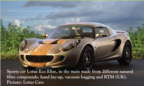
Sports car Lotus Eco Elise, in the main made from different natural fibre compounds, hand lay-up, vacuum bagging and RTM (UK).

Hemp is good for agriculture, the environment and enhances regional development.