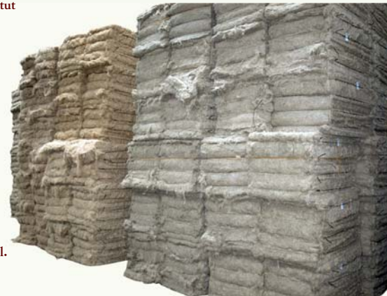
Hemp fibres ready to sell.