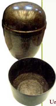
Urn, hemp fibre and bioplastics, compress moulding or injection moulding (Germany).