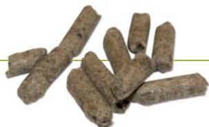
Hemp fibre pellets for granule production.