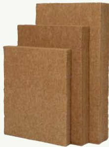
Insulation material, hemp fibre fleece (Germany).