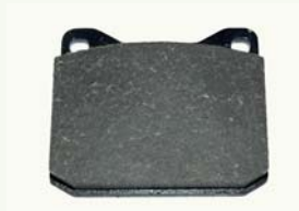
Hemp fibre brake pad for regional trains (UK).

Hemp Fibre can improve the technical profile of bioplastics for use in durable applications.