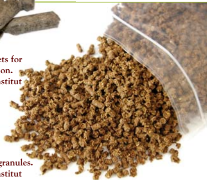
Hemp fibre PP-granules.