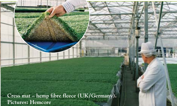
Cress mat – hemp fibre fleece (UK/Germany).