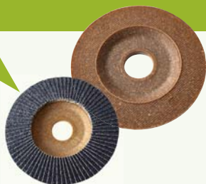
Professional sanding disc with hemp fibre reinforced PP-tray, injection moulding (Germany).