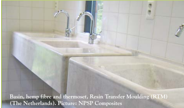
Basin, hemp fibre and thermoset, Resin Transfer Moulding (RTM) (The Netherlands).