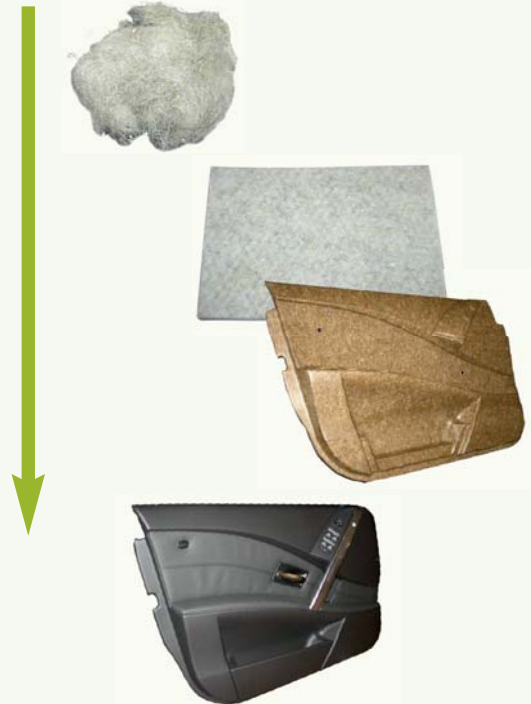
Natural fibre door panel for BMW 5 Series, compress moulding (Germany).