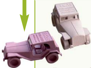
Toy cars, natural fibre and Polypropylen, injection moulding (The Netherlands).