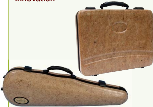
Cases, natural fibre and polypropylen, compress moulding (Germany).